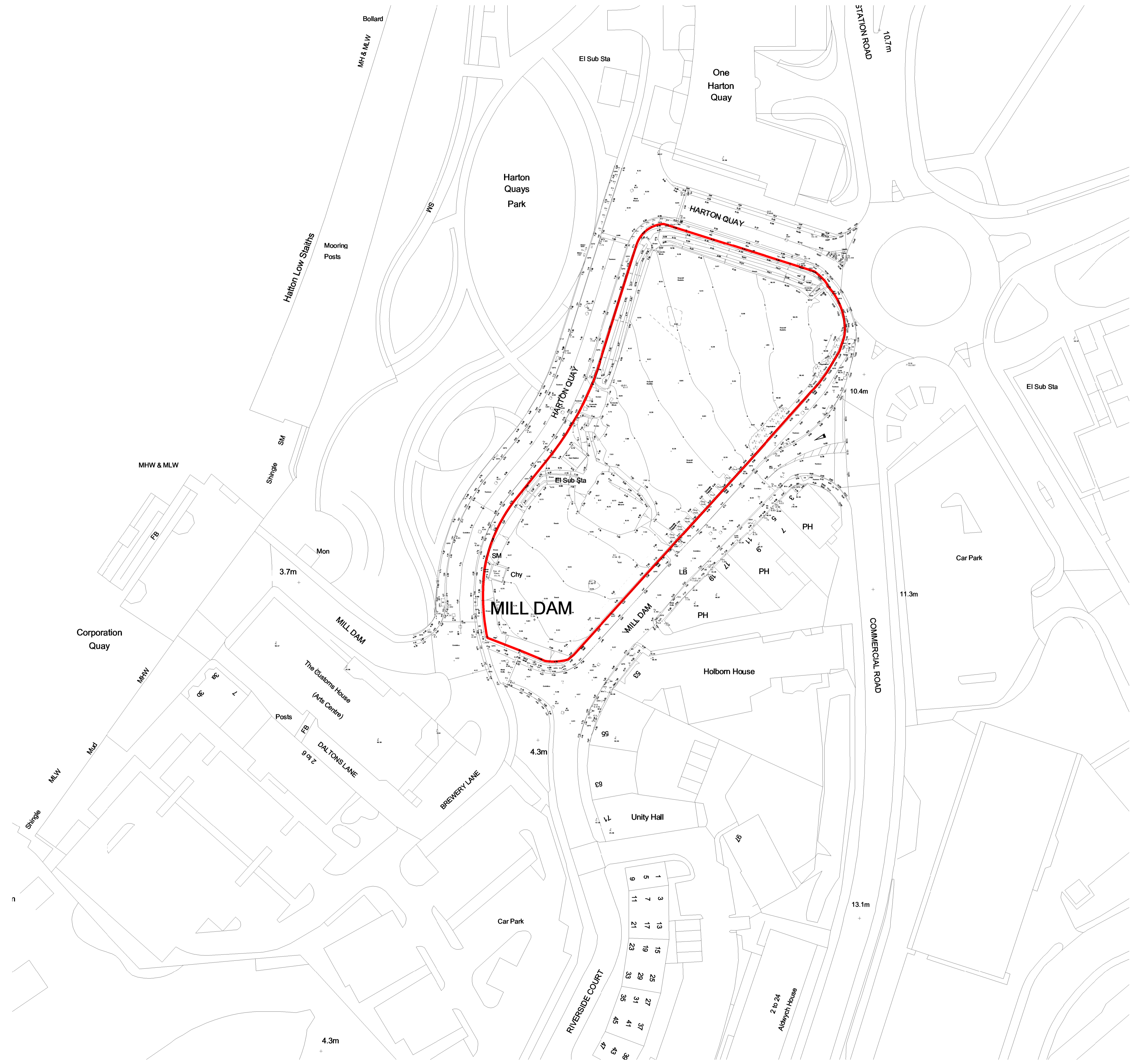
1 Existing Site Plan 1 : 500